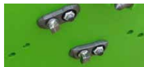
Carbide Thumbnail Teeth