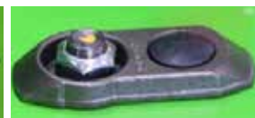
Tooth Holder Delete Kit