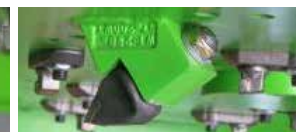
Shark Extension Tooth