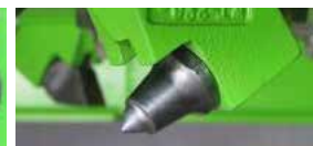
Carbide Bullet Extension Tooth