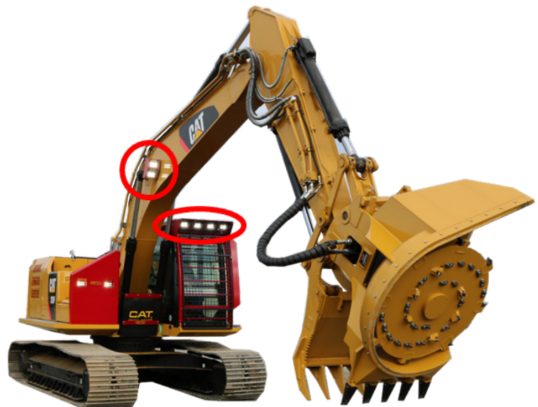
PART #ELK Light Kit (6) LED lights on cab guard & (4) LED Lights mounted on boom

PLEASE NOTE: This guard is intended as a brush guard only. It is not a certified FOPS/ROPS guard.