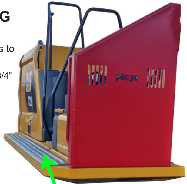
PART #ELRB Logger style running boards