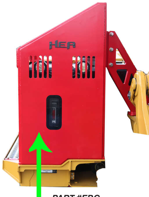
PART #EBG Right side logger style box guard with (2) LED lights