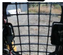
View From Inside Looking Out