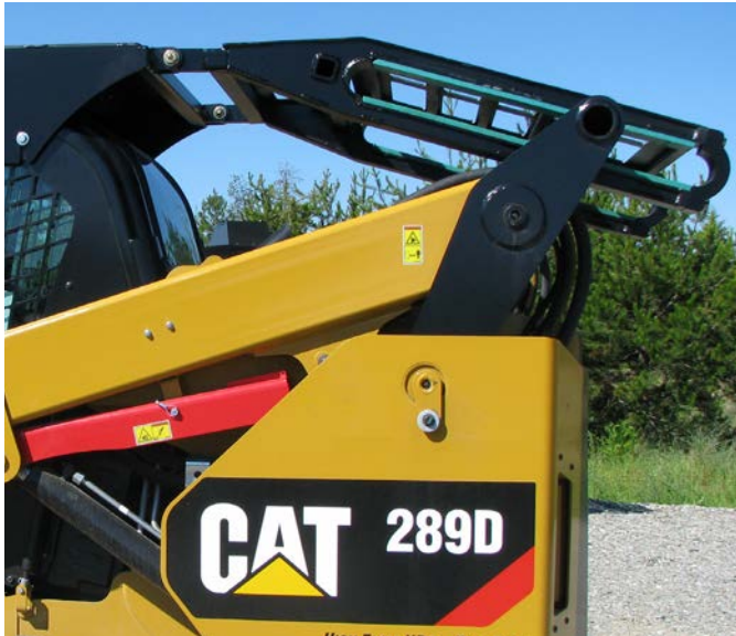
Enhanced CAT Skid Steer Guarding System PART #CATD-EG [SHORT]