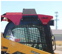
CAT Skid Steer Top Cab Guard System PART# CATD-CG (Shown with Caterpillar Cooler)