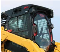
CAT Skid Steer Top Cab Guard System PART# CATD-CG (Shown without Caterpillar Cooler)

Fits current CAT "D, D2, & D3" model skid steers, compact track loaders, and multi terrain loaders: