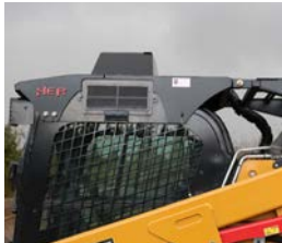
CAT Skid Steer Top Cab Guard System PART# CATD-CG (Shown with Caterpillar Cooler)

GUARDING FOR TOP OF THE CAB. DON'T LET FALLING OBJECTS STOP YOU. [PART# CATD-GC]